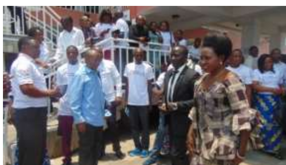
After approval of the opening of the campaign Mr. Appolinaire talking to accompany Minister Provincial of the Justice and human rights.